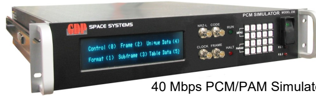
40 Mbps PCM/PAM Simulator

The GDP Space Systems Model 236 PCM/PAM Simulator addresses the need to perform cost effective PCM or PAM clock and data simulations. The unit facilitates widespread use of PCM by combining the most desired application features users into one unit. The Model 236 is ideal for PCM users who do not have the time or the inclination to become simulator programmers. The Model 236 allows users to directly describe a telemetry format in response to plain language prompts using the front panel keyboard and high-contrast vacuum fluorescent display.